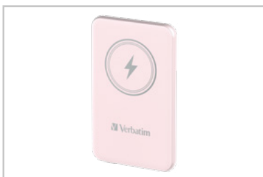
32243 - Front Angled