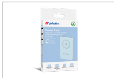
32242 - Packaging 3D