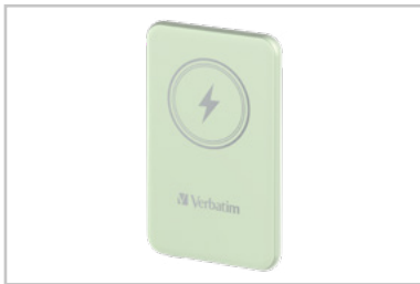
32241 - Front Angled