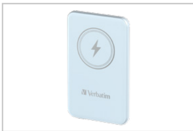
32242 - Front Angled