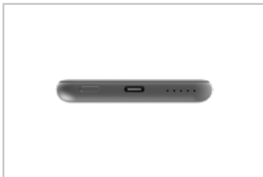
32244 - Front Angled