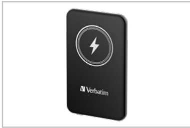
32240 - Front Angled