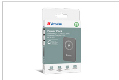
32244 - Packaging 3D