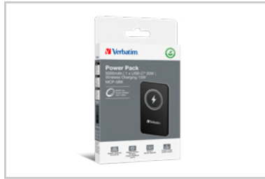
32240 - Packaging 3D