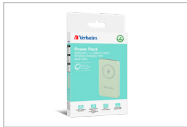
32241 - Packaging 3D