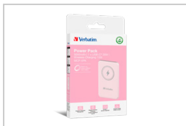
32243 - Packaging 3D